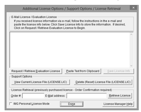
Chapter 2. Getting Started

The Additional License Options section has tools and options to Enter or Paste Evaluation or Other License Information; Request and Retrieve Evaluation Licenses; Support Options to View and Delete (Reset) the License file; and a mechanism to retrieve a Purchased License by entering the Order Confirmation Number and the Order E-mail address.