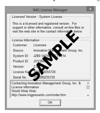
Chapter 2. Getting Started

When properly Licensed, a screen similar to this will show the License Information for the product. The display of this indicates that the software is Licensed.