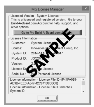
Chapter 2. Getting Started

The third view shows details on how the System License was evaluated by the License Manager.